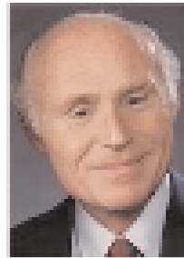
Sen. Herbert Kohl Democrat

330 Hart Senate Office Building Washington, D.C. 20510-4903