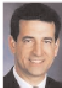
Sen. Russ Feingold Democrat

330 Hart Senate Office Building Washington, D.C. 20510-4903