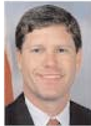
Rep. Ron Kind

Democrat 1406 Longworth House Office Building Washington, D.C. 20515-4903