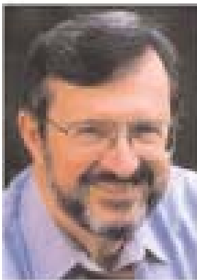
Rep. David Obey

506 Hart Senate Office Building Washington, D.C. 20510-4904